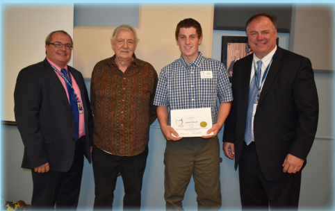
Scholarship awards range from $650-$850

It is important to note that because HRCCSF is a volunteer organization, none of the money raised is used for administrative costs. All dollars raised in our community are awarded to local students.