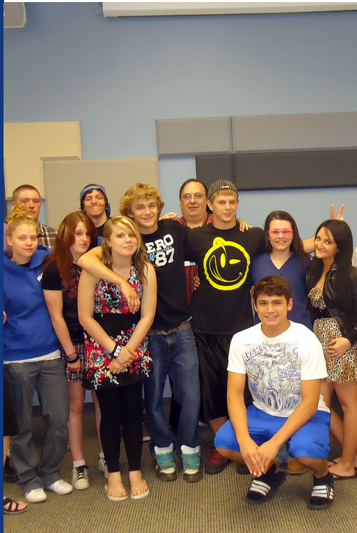
Students gather for a photo at the end of a Regional Learning Academy Luncheon. The RLA has become part of the new Pathways Academy. The RLA Luncheon provided students with positive feedback about ways they improved during the school year.