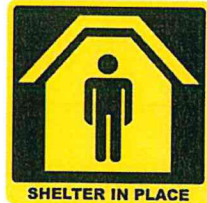
SHELTER IN PLACE

SHELTER IN PLACE * Outside or community incident * All doors locked, no one in or out of building * Teaching and activities inside building continue as normal * Buses in route redirected to safe location