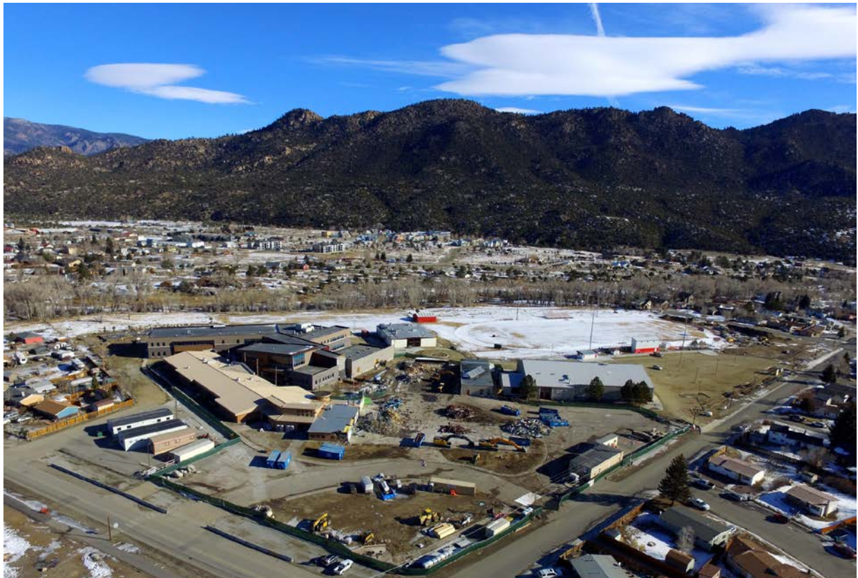
Overhead View of Phase A and the Start of Demolition: Below