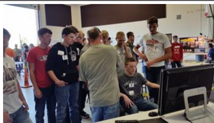
Heavy Equipment Operator Simulation