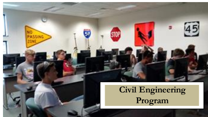
Civil Engineering Program