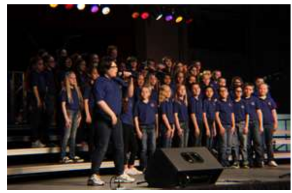
High School Band – 2015-2016