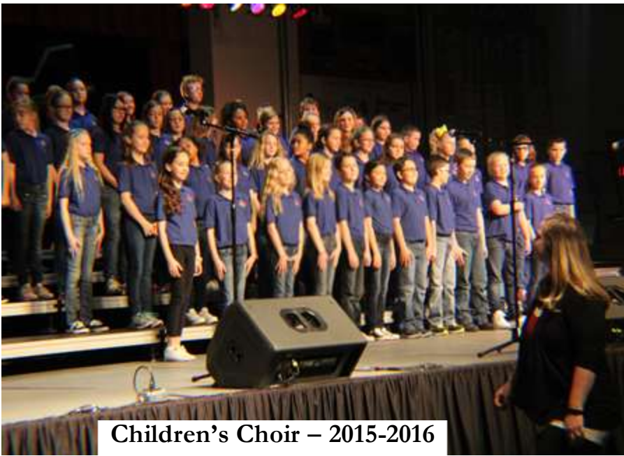
Children's Choir – 2015-2016