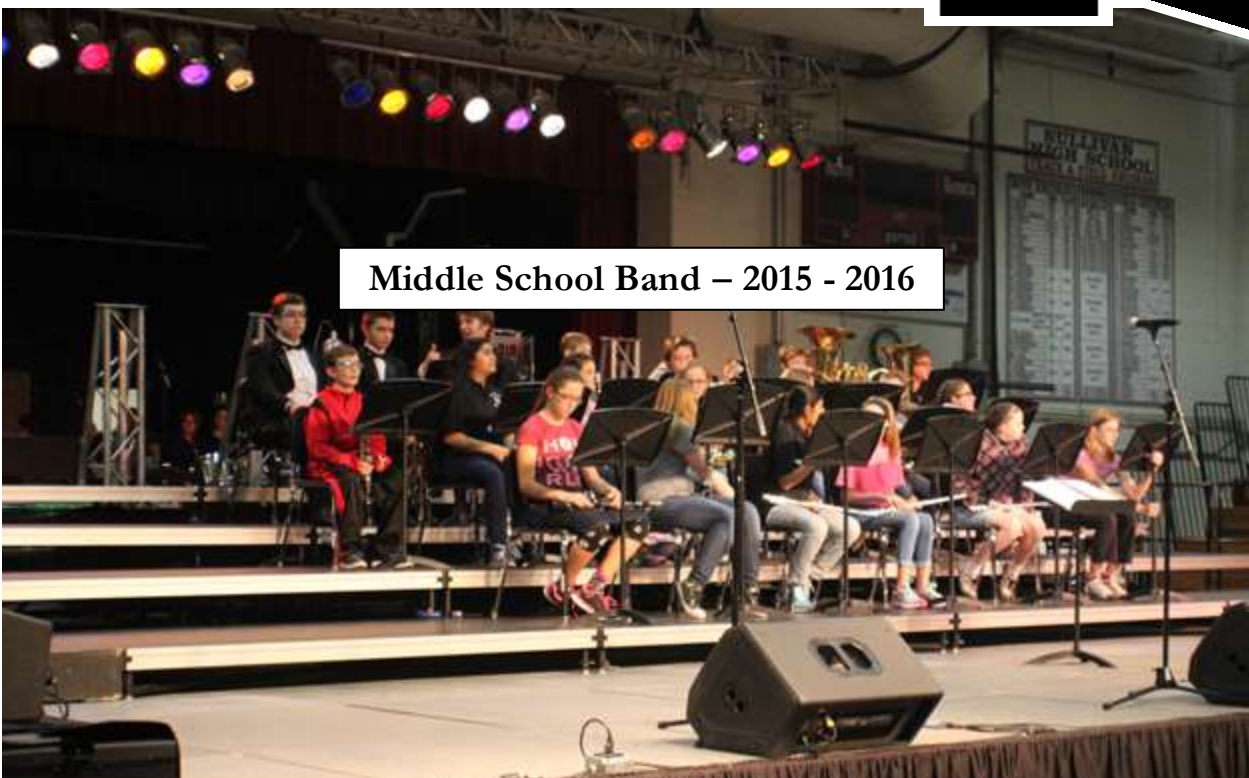
Middle School Band – 2015 - 2016