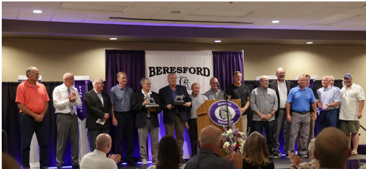
Pictured: 1979 and 1980 Beresford High School Football Team Members