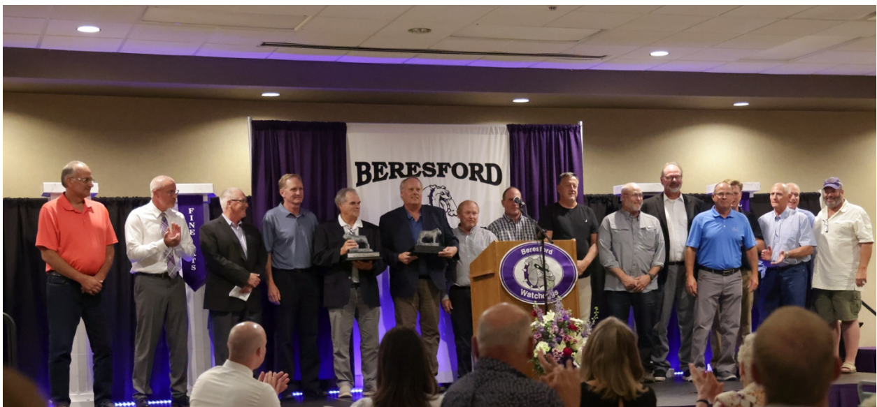
Pictured: 1979 and 1980 Beresford High School Football Team Members