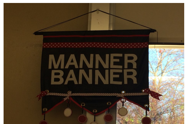
The prestigious "Manner Banner"