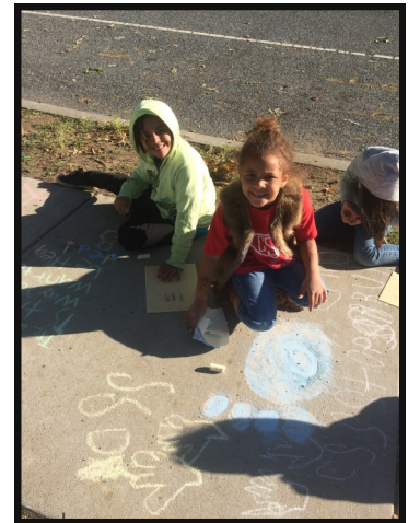
Charles Street School first graders preparing for the chalk walk!