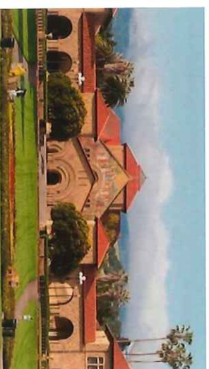
Stanford University, CA