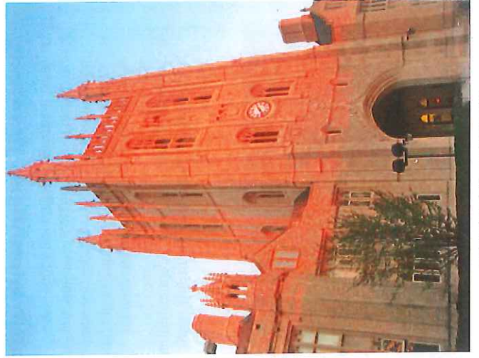
University of Missouri-Columbia

The Hagan Scholarship is a nationwide need-based merit scholarship. Recipients must graduate from a public high school located in a county in the United States having fewer than 50,000 residents. The scholarship provides up to $6,000 each semester for up to 8 consecutive semesters. Six hundred twenty two Hagan Scholars from 37 states currently attend 236 colleges and universities.