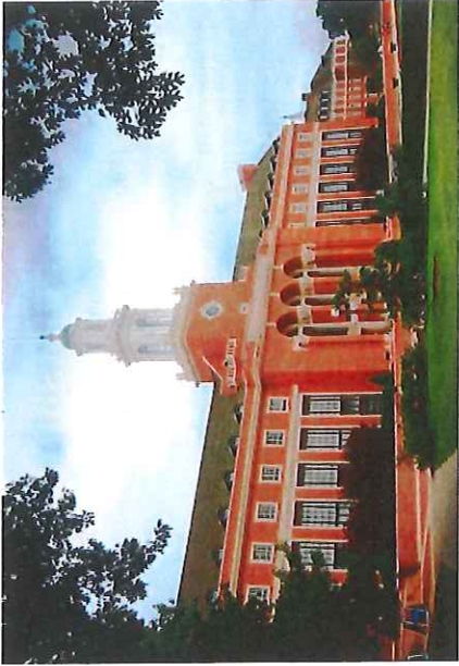
Oklahoma State University