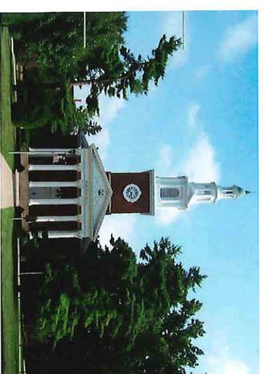
University of Kentucky