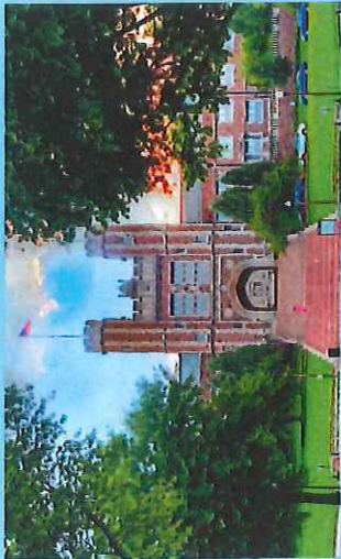
Washington University in St. Louis