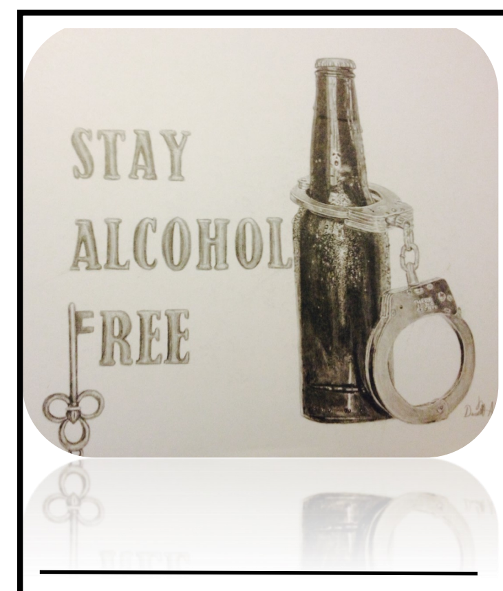
This message brought to you by your Cascade DUI Task Force

Not many people pay attention to all of the harm that drinking and driving does especially during the summer when multiple BBQ's, parties, rodeos, and reunions are taking place. Everyone just wants to have a good time and put everything consisting of worries and conflicts on the side. They begin to forget the fact that driving while intoxicated costs lives.