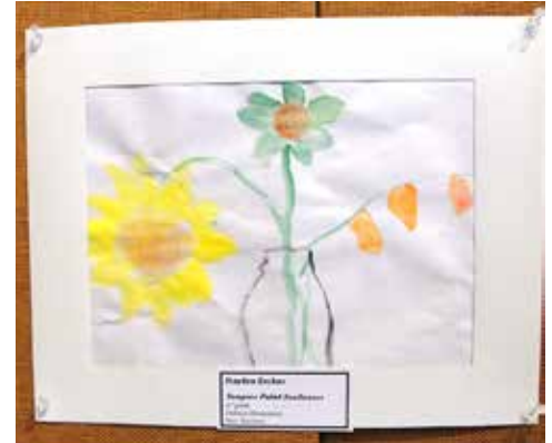
Student art work from a past Winterfest Pioneer Art Show.

The Historical Society is excited to have the Pioneer Student Art Show as the first exhibit in the renovated building, which is