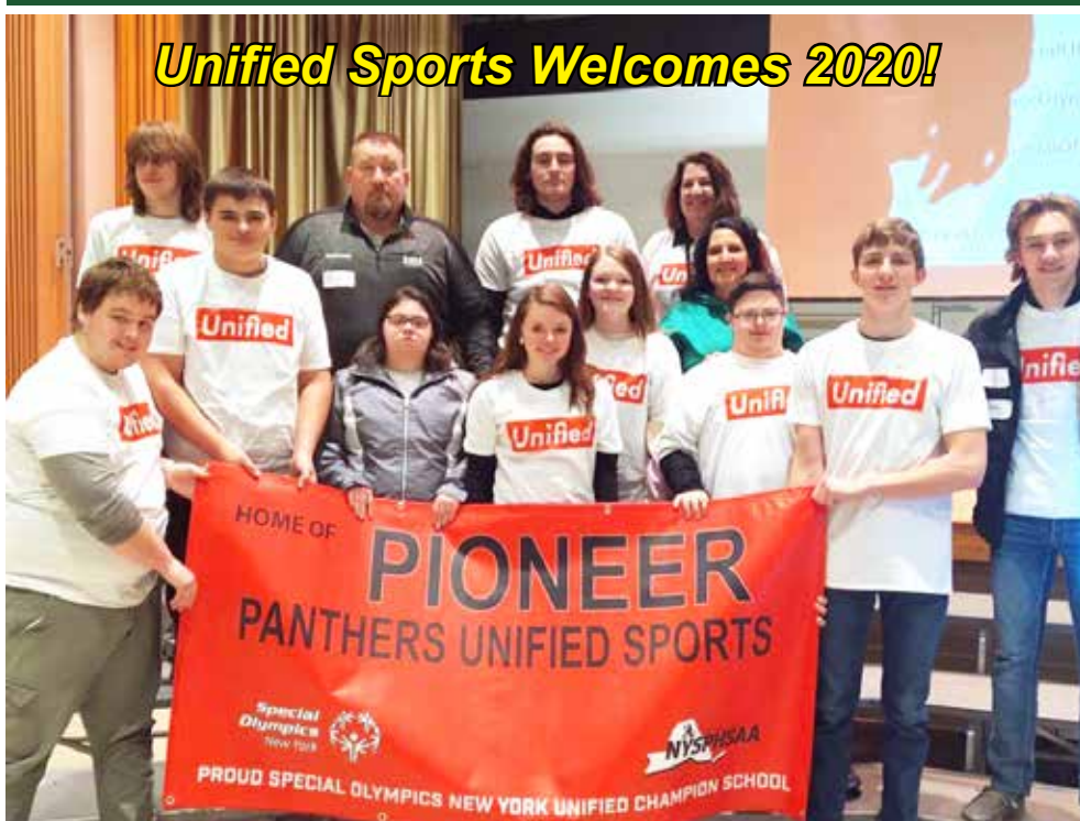
Pioneer's Unified Sports team members are gearing up for another season. They recently attended the 2020 Unified Youth Activation Leadership Summit at Eden Central School. Look for where and when you can catch these Unified Sports athletes in action.