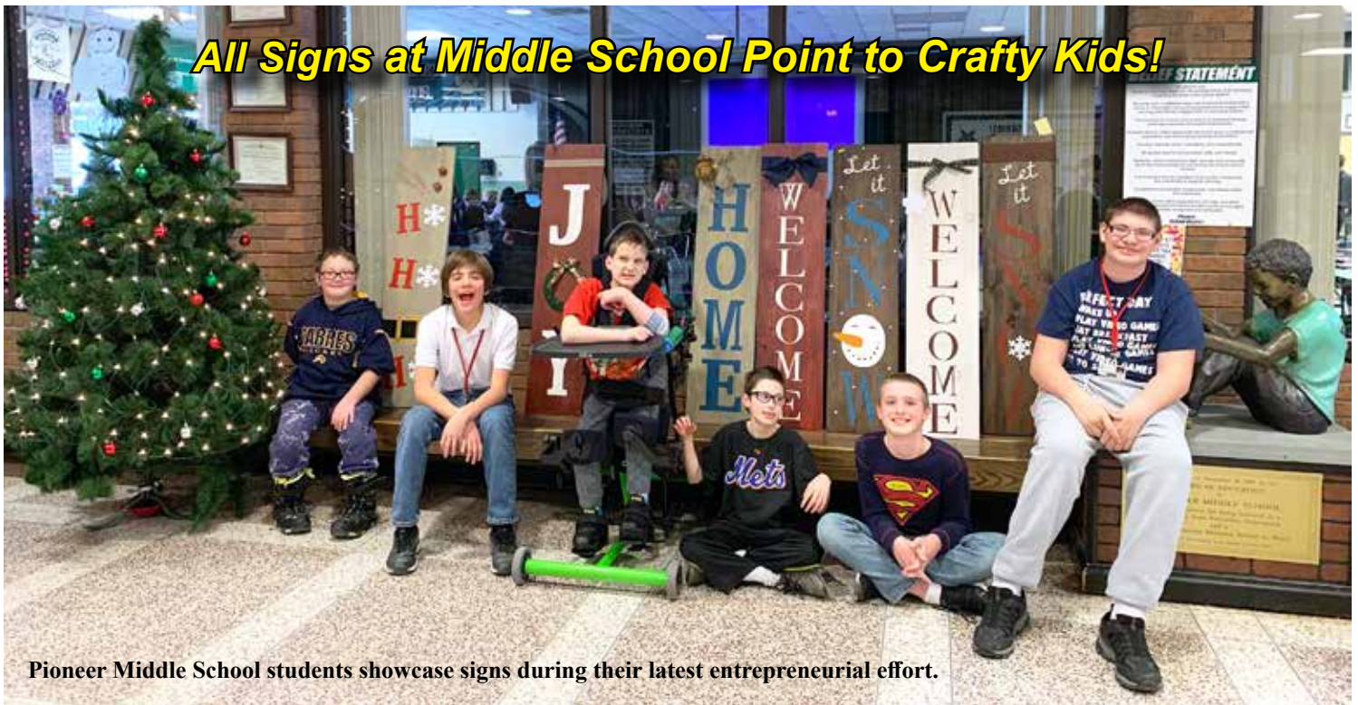
Pioneer Middle School students showcase signs during their latest entrepreneurial effort.