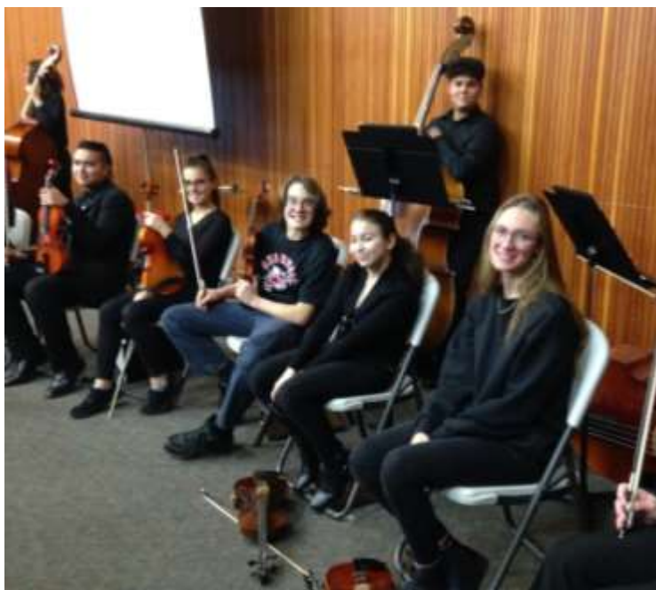
Pictured at left: Orchestra students wait to perform at WIS

On November 15, the BHS Jazz Band, Orchestra, and Marching Band went on tour, performing at Artis Senior Living, Sliney Elementary School, and Walsh Intermediate School. Marching Band performed selections from their fall field show, and Jazz Band and Orchestra performed a preview of some of their winter concert music. The instrumental music winter concert is Tuesday, December 17 (snow date is December 18) at 7:00 p.m. in the Cathyann Roding Auditorium at BHS and will also feature students from the Concert Band class.