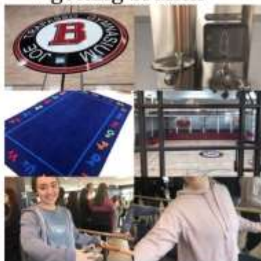
the new community center is gorgeous with lots of new equipment