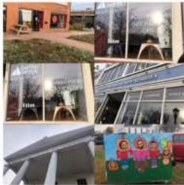
walking through town