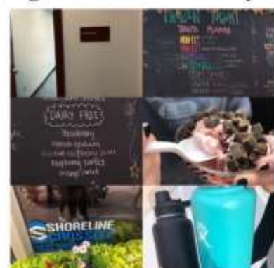
Ashley's has new dairy free options, don't forget to stay hydrated!!