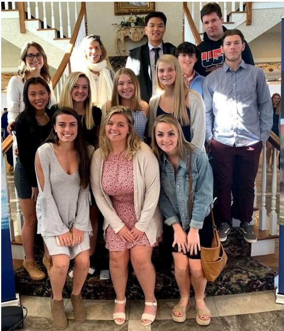
BHS Class Act Committee at the CIAC 2019 Sportsmanship Conference 11/21/19