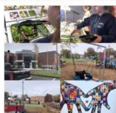
seeing the new community center!!