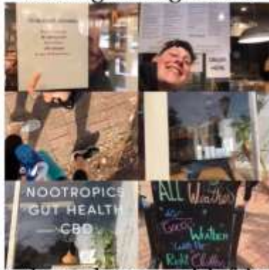
walking through town with friends + getting brunch