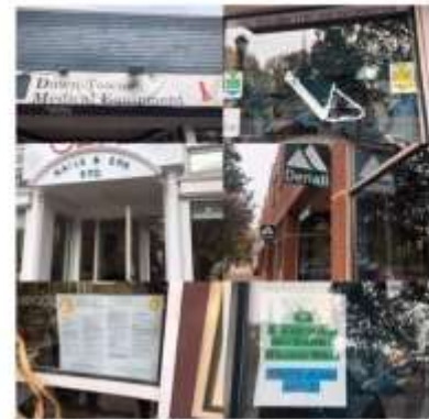
places in town to eat + relax 🍷🍷