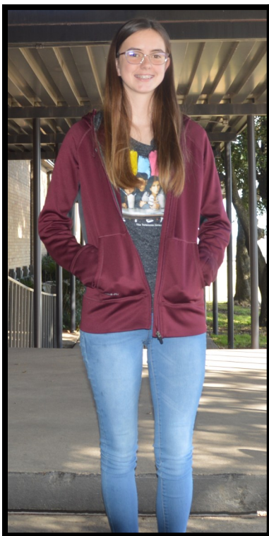
2nd Team All-District