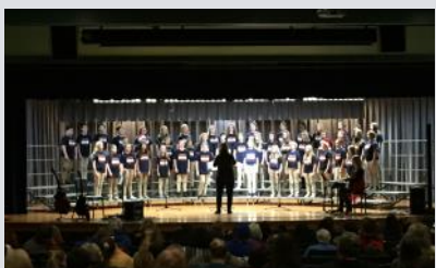
The GCMS Chorus recently performed their holiday concert!