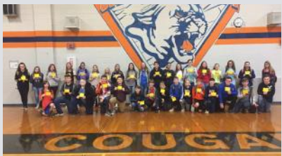
Cougar Excellence Winners from November!

MARK THE DATES! GCMS Hosts Board Meeting - Jan. 9 @ 6 p.m. MLK Day - No School - Jan. 20 Boys GRVC Tourney - Jan. 25-30 Deadline for Online Yearbook Ordering - Mar. 15