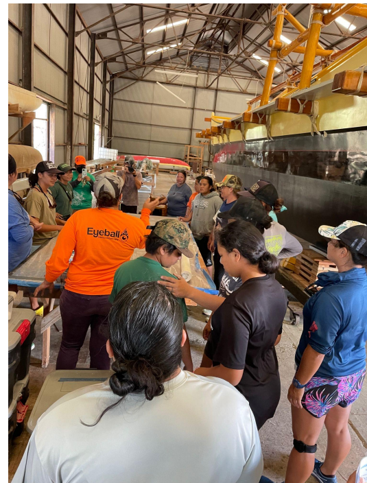
Mālama Honua Fall Events