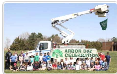
4 th Grade Celebrated Arbor Day at FCHS with the city of Geneva, Faller Landscaping, Nebraska 811, & NPPD