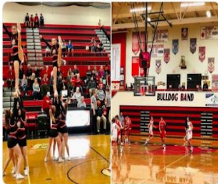
It's Highland vs. Chatham! Let's go Dogs!