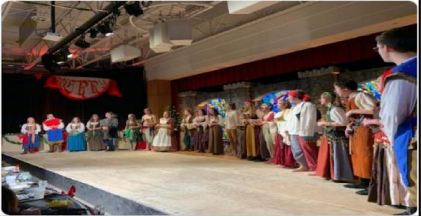
Faerie and Gypsy Dance