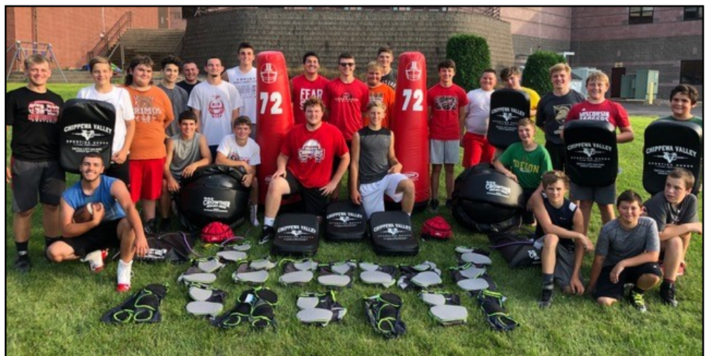
Shown above are members of the Greenwood High School Football Program along with the equipment purchased with the WFCA Grant they received.