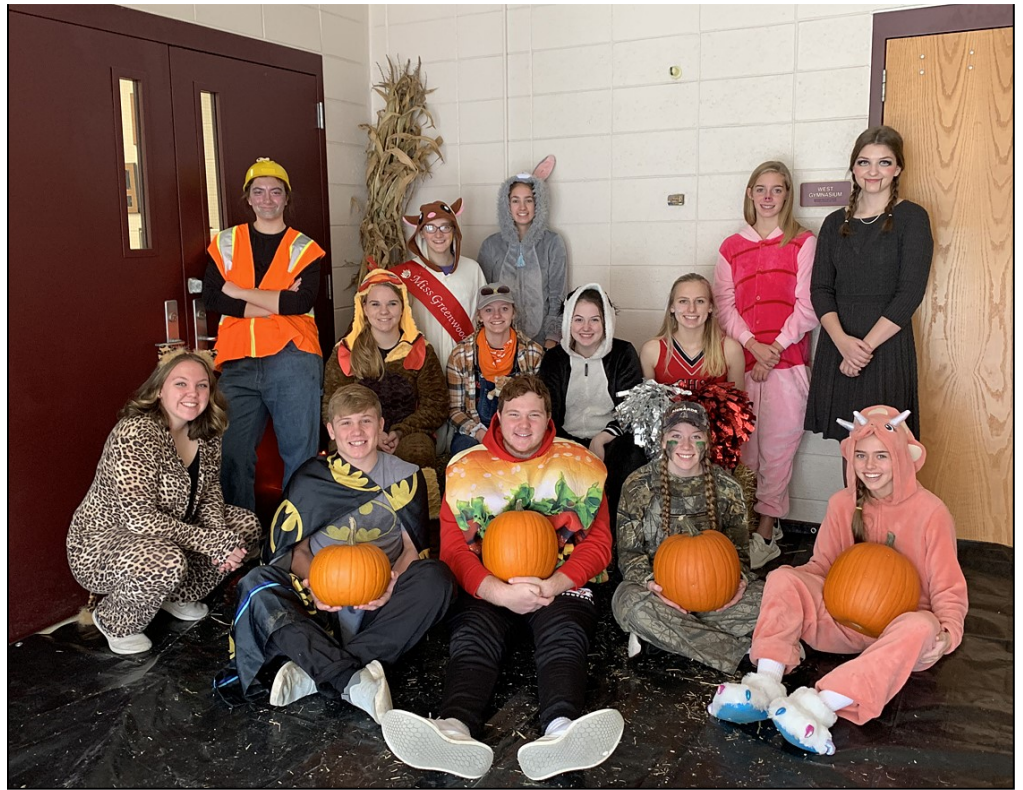
NHS and FCCLA members shown above in costume pose for a quick picture before students arrive for the Annual Halloween Party.