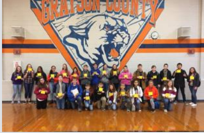
Cougar Excellence Winners from October!

MARK THE DATES! Girls Basketball GRVC Tourney - Dec. 7-10 KYA Conference - Dec. 15-17 Last Day Before Break - Dec. 20 Deadline for Online Yearbook Ordering - Mar. 15