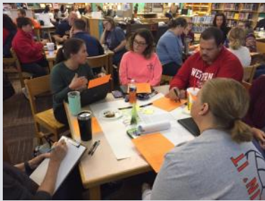
Sharpening Skills On Election Day, GCMS teachers spent the day learning about and discussing high-yield instructional strategies!