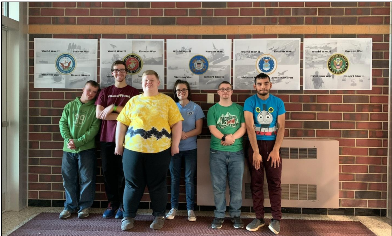
Students learned about the five branches of the Armed Forces and discussed what Veterans Day means to our community. Together, they worked on posters to display how several generations of each branch participated in the major conflicts of the 20th century. They were proud to share about their family members' service in the military.