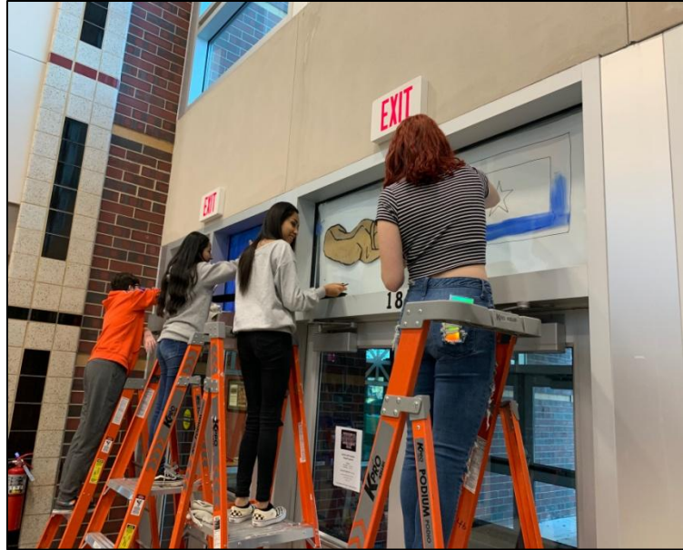
Painting students create window art to welcome veterans and the community to our program on November 11 th .