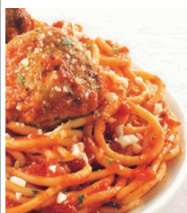
St. Vincent De Paul Spaghetti Dinner

Annual Fund Raiser—WEDNESDAY, NOVEMBER 13, 2019 AT Columbus Hall, 112 E. Lexington Ave., Elkhart, Time: 5:00 – 7:00PM Adults $9, children 6 to 12 $4, (5 & under eat free)