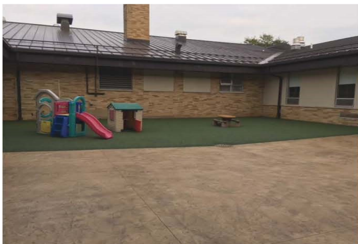
Courtyard Play Area at Elementary School