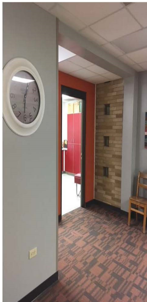
Reception Area Remodel at Elementary School