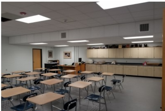
New Ag Classroom

In the lower-level gym bathrooms, damaged plumbing fixtures and toilet partitions have been replaced. New tile flooring, ceiling tile, and LED lighting give these bathrooms a refreshed look. New high-efficiency boilers will replace aging, inefficient boilers. A new electrical service and panel board system have also been installed. Lastly, new ceilings in the upper floor corridors address noise concerns and provide an opportunity for more efficient LED lighting.