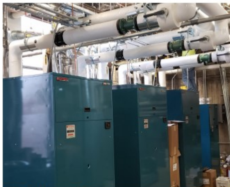
High Efficiency Boilers

In the lower-level gym bathrooms, damaged plumbing fixtures and toilet partitions have been replaced. New tile flooring, ceiling tile, and LED lighting give these bathrooms a refreshed look. New high-efficiency boilers will replace aging, inefficient boilers. A new electrical service and panel board system have also been installed. Lastly, new ceilings in the upper floor corridors address noise concerns and provide an opportunity for more efficient LED lighting.