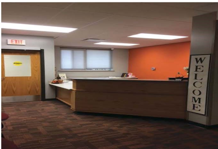
New Reception Desk at Elementary School

Lastly, the gym received a new roof and the locker room showers have been converted into flexible space for staff use.