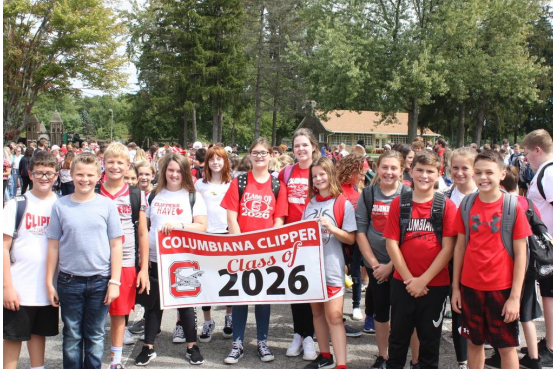
Columbiana Class of 2026