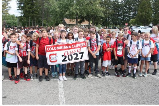
Columbiana Class of 2027