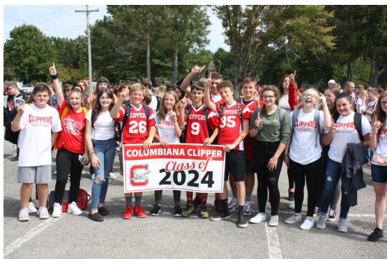
Columbiana Class of 2024

On Friday, September 6th, students throughout the district joined together at Firestone Park stadium for a district-wide pep assembly. We had a great time celebrating Pre-K through 12. Go Clips!