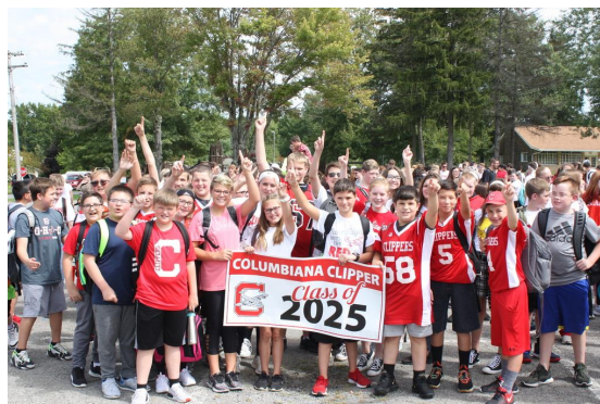
Columbiana Class of 2025