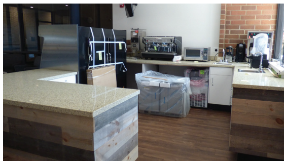
The Birds + The Beans coffee kiosk is rapidly taking shape!

The Birds + The Beans is set to open in October. Stay tuned!