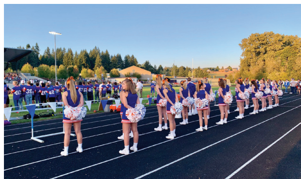
RHS Cheer Team