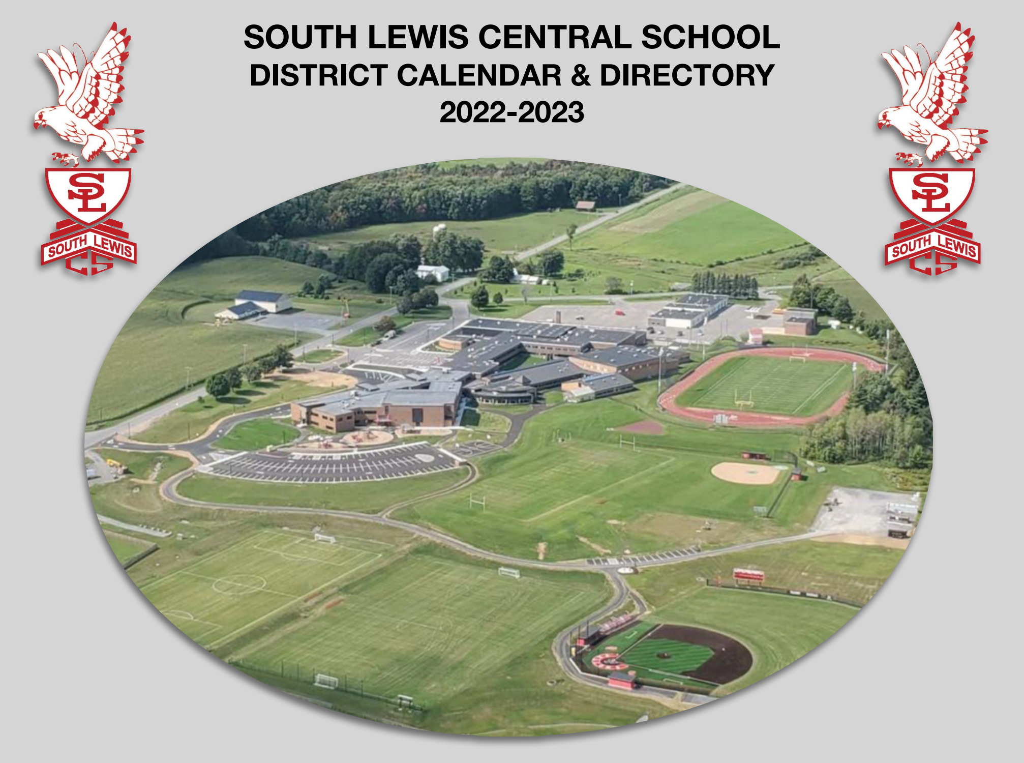
ONE DISTRICT - ONE BUILDING - ONE FAMILY