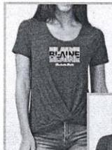
Twist detail in front. Hi-Lo Style T-shirt.