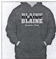
7.8 ounce 50/50 Cotton Poly Fleece Blend