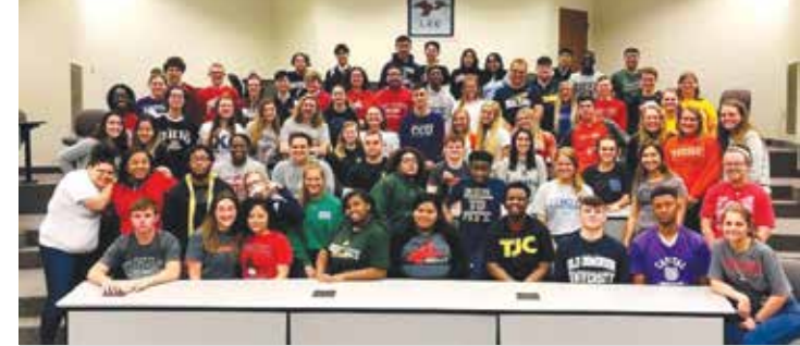
Class of 2019 celebrated College and Career Decision Day!