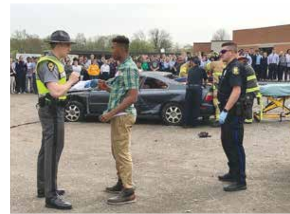
Students and local officials participated in a mock crash event at LCC to educate students on the importance of making good choices and being responsible drivers.