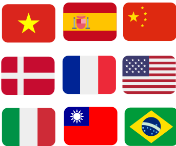
9 different Countries represented at LCC in the 2019 school year!