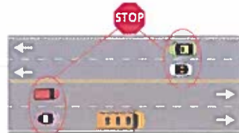
Four-lane Roadway with Double Yellow Line When a school bus stops and activates its stop arm and flashing red lights, all traffic must stop from both directions.