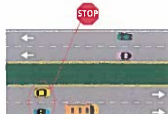
Divided Highway with Median Separation When a school bus stops and activates its stop arm and flashing red lights, traffic approaching the bus from behind must stop.