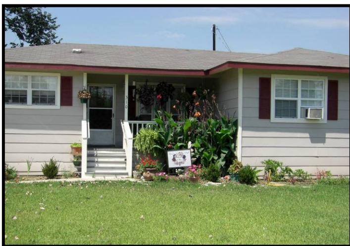
Release from the Itasca Garden Club

The Kenneth Upton residence at 308 S. Hill St. had the honor of displaying the Itasca Flower and Garden Club coveted sign proclaiming it the “Yard of the Month” during July. Plenty of greenery and summer flowers make the yard beautiful and inviting. The continual rains have their drawback but they have made the yards very lush and green (those that haven’t drowned).