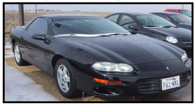
77K Miles, Extra Nice - Only $4,985!

Lloyd Ford – Proud Supporter of the Wampus Cats