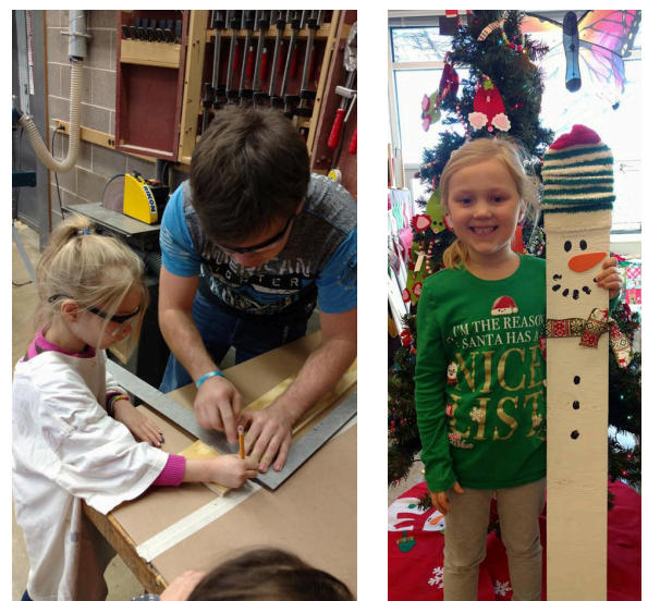
Above: An IT student assists a kindergartener with measuring. The finished project (right).