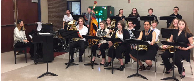
Jazz Band at IASB Dinner.