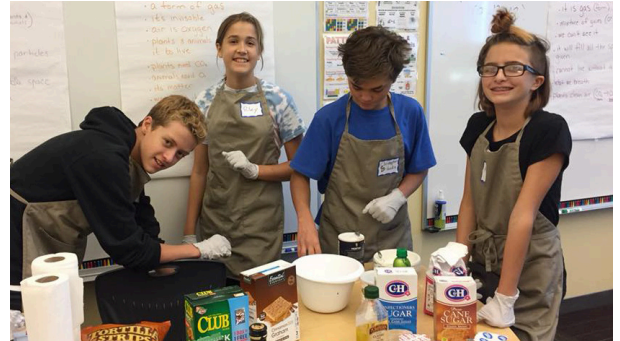
4-H After-school Enrichment Program