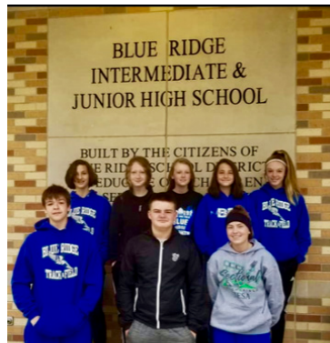
Jr. high track stars off to State