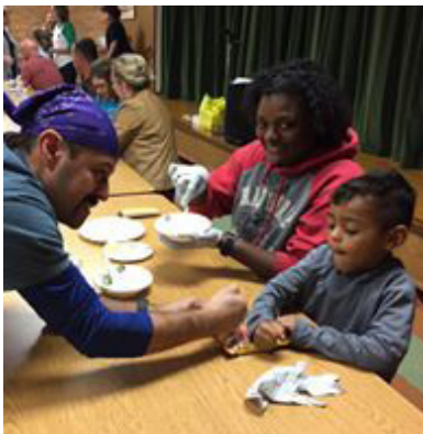
Family Dessert Challenge