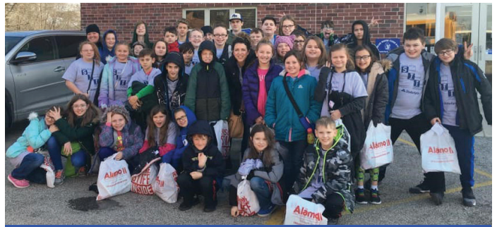
Students Involved with Technology Conference

40 participants in grades 4-8 attended the Students Involved with Technology Conference. This event is unique as students learn from their peers in each session. Boosters gave $10 to each student who spent $30 on a registration fee to participate.