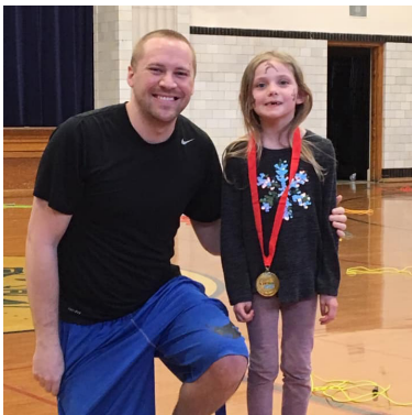
Kids' Heart Challenge winner