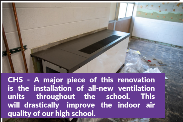
CHS - A major piece of this renovation is the installation of all-new ventilation units throughout the school. This will drastically improve the indoor air quality of our high school.