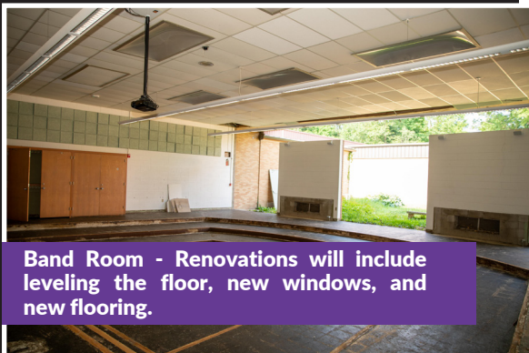
Band Room - Renovations will include leveling the floor, new windows, and new flooring.