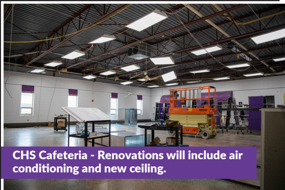
CHS Cafeteria - Renovations will include air conditioning and new ceiling.