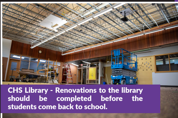
CHS Library - Renovations to the library should be completed before the students come back to school.