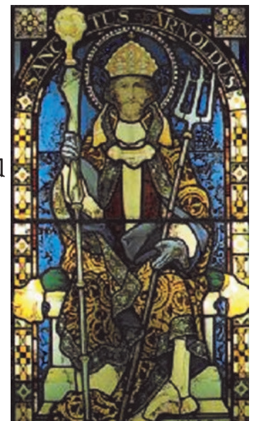
St. Arnold of Soissons, ora pro nobis!

Interested in learning more about this life giving ministry of brewing and contributing to your parish's social health? Come join us August 3rd at 9:00am in the St. Thomas parking lot for the first official Arnie's Crew brew day. Sign up sheets are in the gathering space.