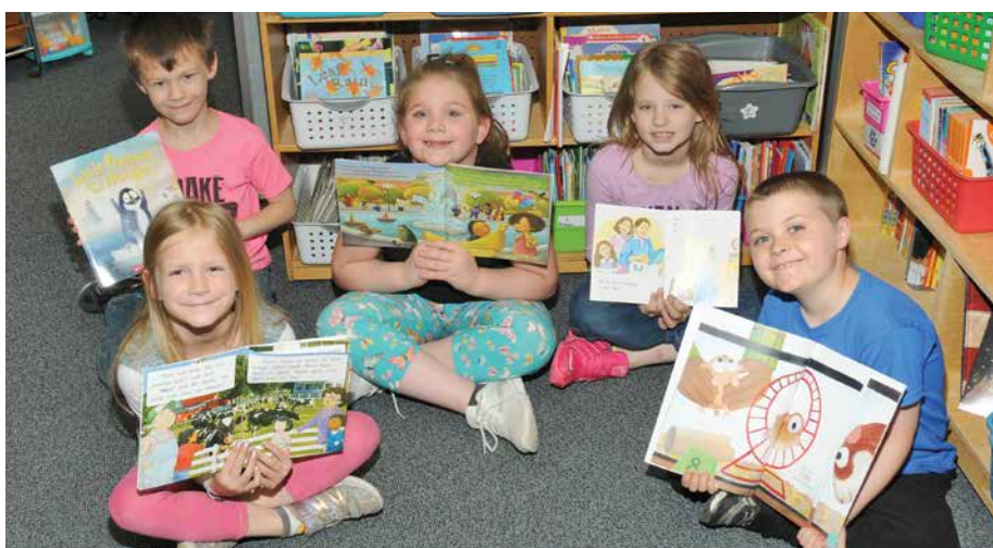
Our students can be proud of how far they have come and look forward to another great school year in 2019-20!