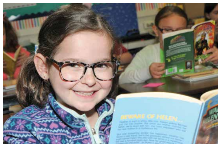
Reading is fundamental to all other areas of learning. We encourage our students to read as much as they can!

In order to keep all of our students safe during outside lunch day, no students will be allowed outside unless proper attire is worn. Sweatshirts are not considered proper attire on cold weather days.