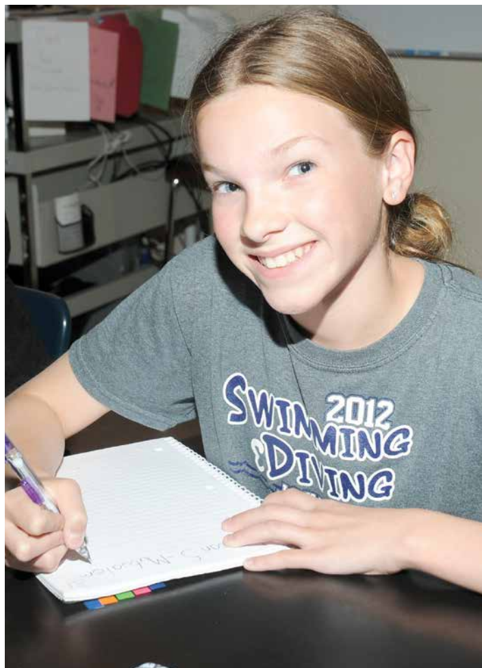
Each student is an integral part of our school community.