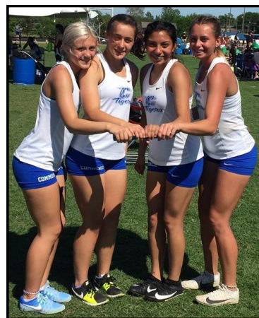
4X100 Relay-3rd at Regionals