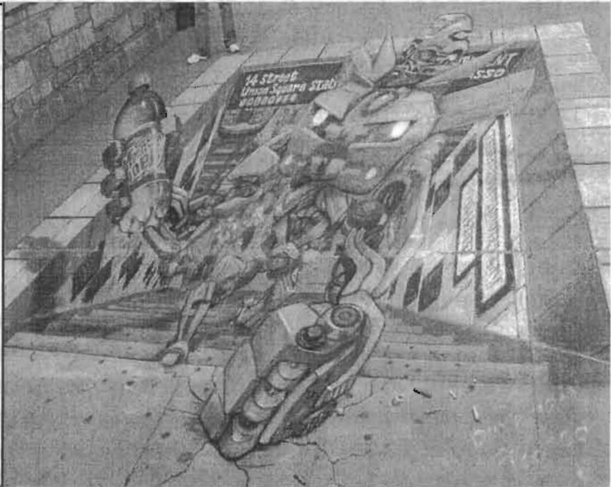
Sweet Advertisement in Union Square, New York City

Regular (8 fl. Oz) Contains: Carbonated water, high fructose corn syrup and/or sugar, concentrated orange juice and other natural flavors, citric acid, sodium benzoate (preserves freshness), caffeine, sodium citrate, gum arabic, erythorbic acid (preserves freshness), calcium disodium EDTA (to protect flavor) and brominated vegetable oil, yellow 5.