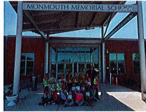
We received a grant from Dollar General for K-2 literacy supplies!