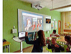
5th Graders read virtually to the residents at The Maine Veterans Home in Augusta as their weekly reading program