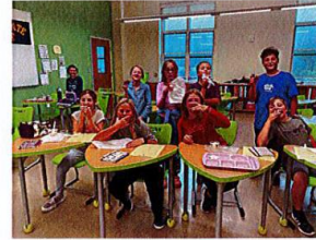
5th Grade Writers Cafe!