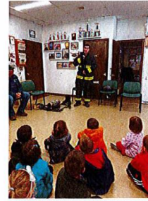
Grades Pk-2 Field trip to Monmouth Fire Department for Fire Safety Week