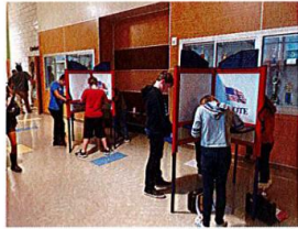
Students in 4th-8th grade participated in the State of Maine Mock Election on Tuesday, October 25th.