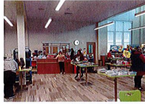
Middle School Students browsing the Scholastic Book Fair Spring of 2023