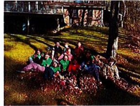
Day of Caring 2022