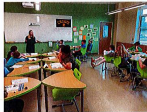
A Camden National Bank Representative came to speak to 5th graders about financial literacy for Junior Achievement!