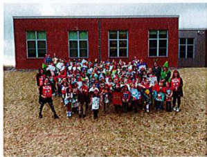
K-2 Students dressed up as Gift bags as their Team Dress Up Day for December to Remember!