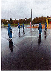
2nd Grade enjoys recess rain or shine in their rain suits.