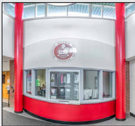
Quest Secure Main Entrance

Residents voted on a $32.25M capital project in Dec. 2016. Since then, Phase 1 (new roof and mechanical systems updated at Hilton High School and tennis courts relocated), Phase 2 (renovations at Quest and Village Elementary Schools, and Merton Williams Middle School), and Phase 2b (renovations at Northwood Elementary School and Hilton High School) have been completed. Planning has begun for Phase 3 and will be communicated to district residents in the near future.