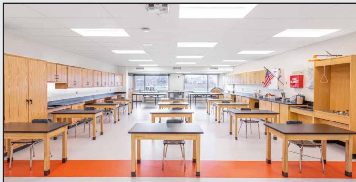
High School Science Room