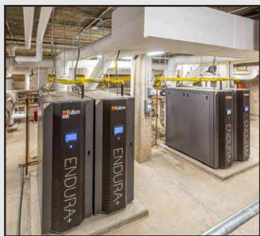
Merton Williams Middle School Boiler Room