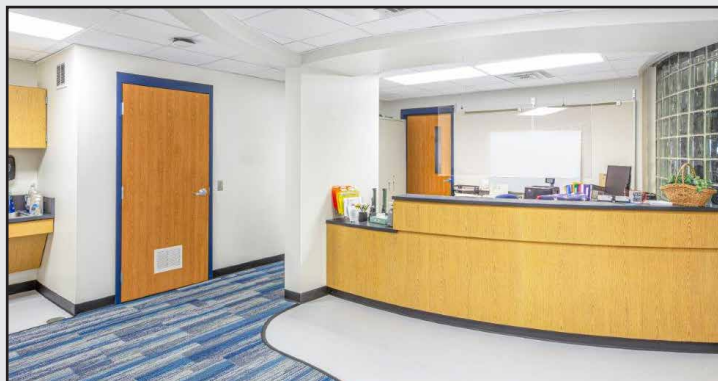
Village Elementary Main Office