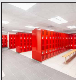
High School Girl's Locker Room