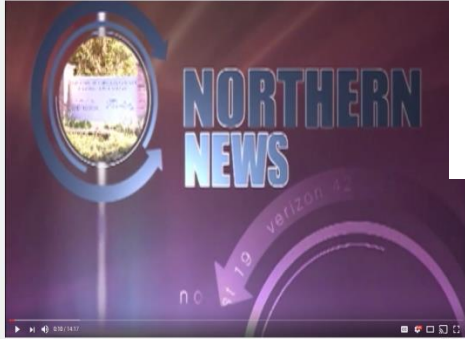
Northern News 2016-17 Show #5