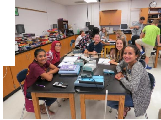
September 21 st HS Classes Underway