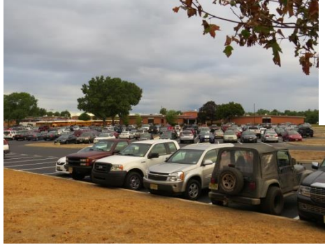
September 6 th Parking Lot Expansion Complete