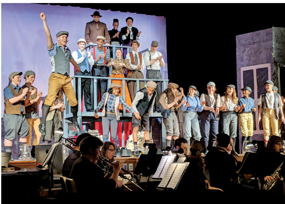
Congratulations on a great show!