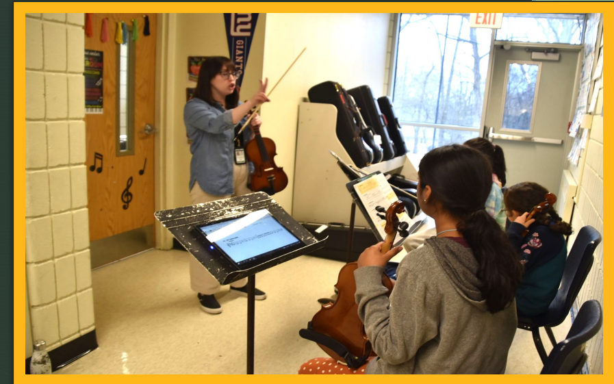
Music lessons in the hallway

... state aid is available for education renovation & upgrades!