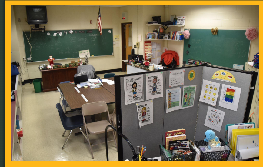
Classroom divided for multiple purposes