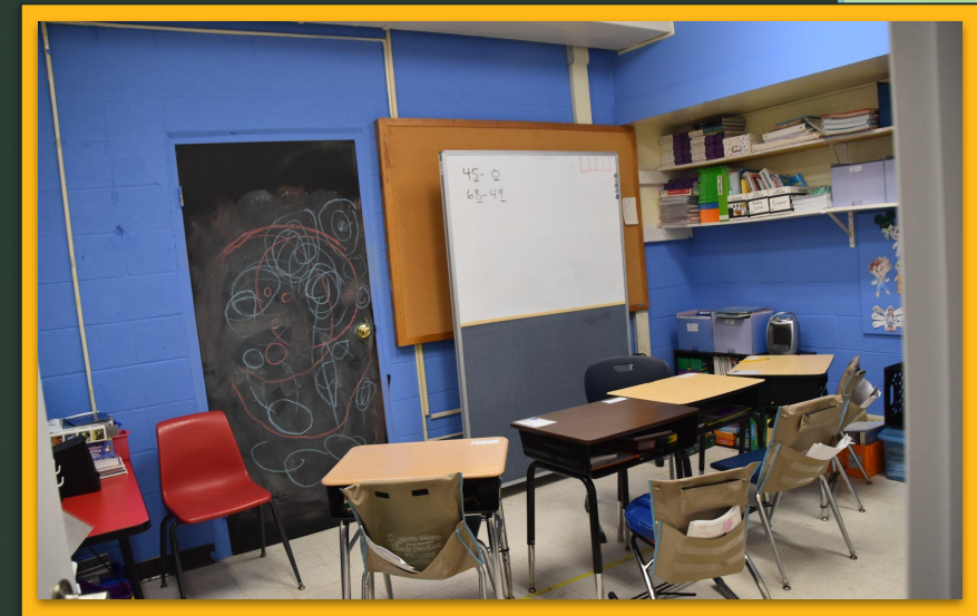
Small-group instruction in a classroom corner