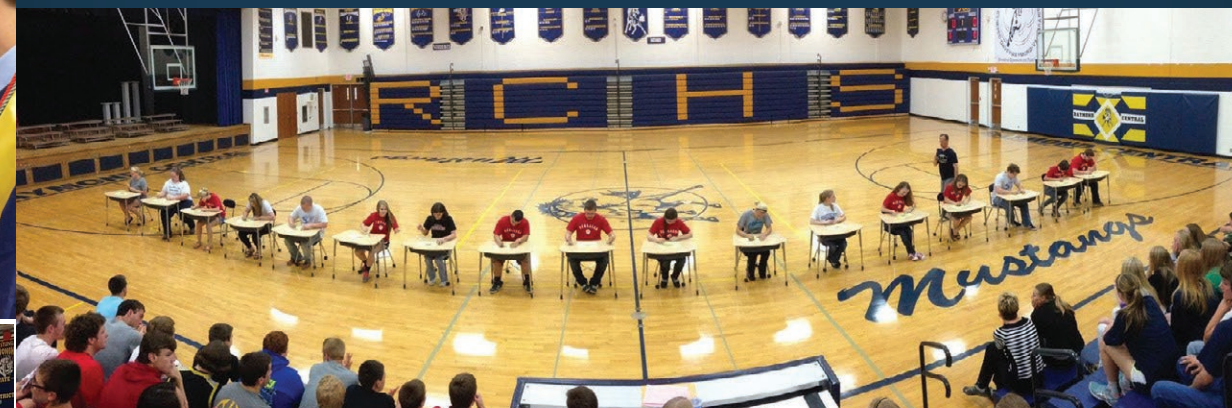
Academic College Signing Day