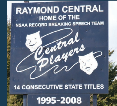
Speech, Drama, Fine Arts