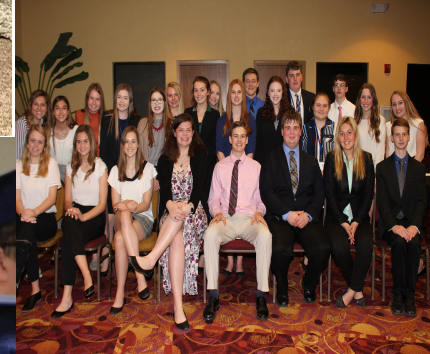
Student Organizations, Athletics