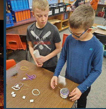
Technology, Safe Learning