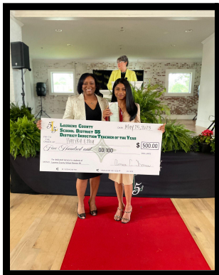
The 2023 Laurens County School District 55 (LCSD 55) Employee