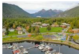
Sitka Fine arts Campus

Sitka has many housing options, including co-occupancy rooms from the Sitka Fine Arts Camp on the historic Sheldon Jackson Campus, long term off-season occupancies at local fishing lodges, hostels, hotels, and B&Bs, and other short-term rentals.