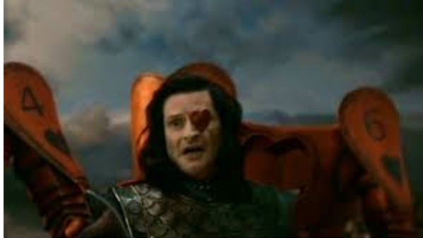
Knave of Hearts - Red