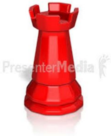
Rook - red clothes - red Burger King crown