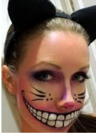
Cheshire Cat - purple and pink shirt/leggings/sweatpants