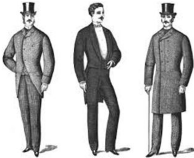
Mad Hatter - Green and blue