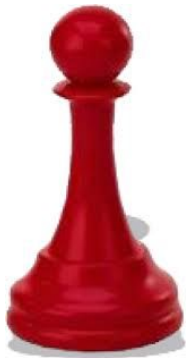
Pawn - red clothes - red beanie