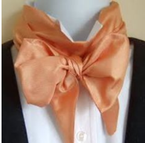
March Hare - orange and brown Brown ears