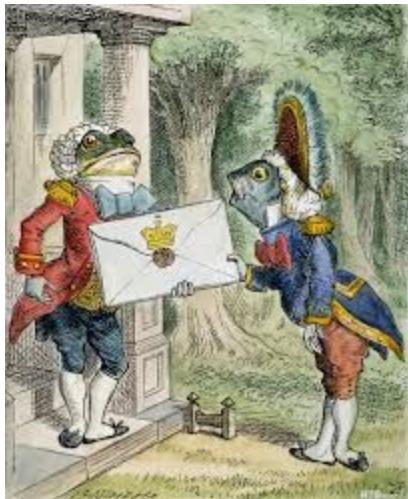
Frog Footman - all green Fish Footman - red and blue