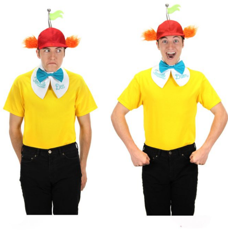
Tweedles - Orange, blue, and Yellow