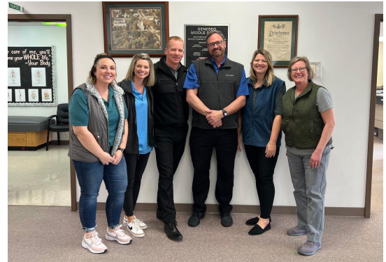
GMS Office Team