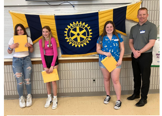
Rotary Club US Constitution Essay Winners

In this section in 2023-24 you will see student-centered highlights from sports, activities, music, volunteering, individual accomplishments, classroom learning, teamwork, collaboration, and more.