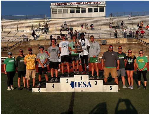
IESA 2023 8th Boys Track 4th Place