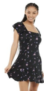
Casual dresses or sundresses.