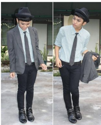
Hats are not allowed. Jackets and ties are discouraged because it will be HOT in the gym.