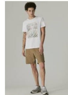
Collared shirts or t-shirts with khakis, jeans, or shorts.