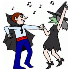
Music & Dancing