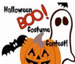
Prizes for Costumes