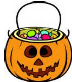
Trick or Treating